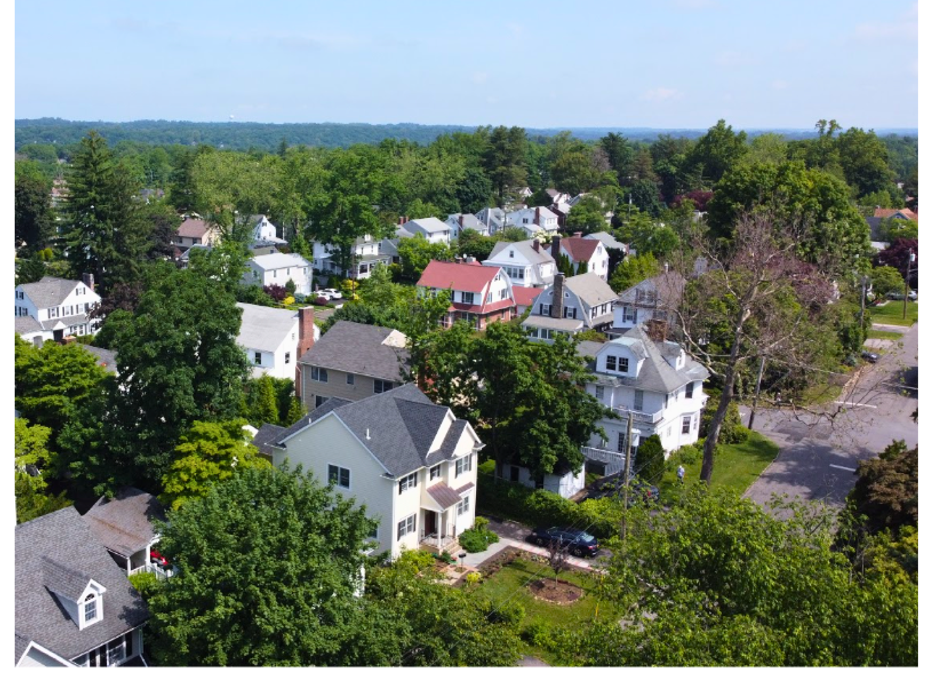
Arthur Manor, Sprague Avenue, between Bell & Webster Roads, circa 2020

Arthur Manor, Sprague Avenue, between Bell & Webster Roads, circa 1898